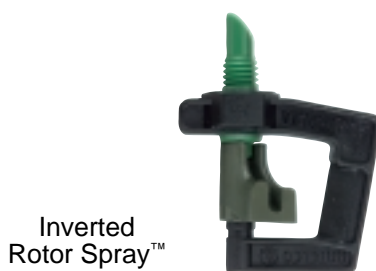
Inverted Rotor Spray™